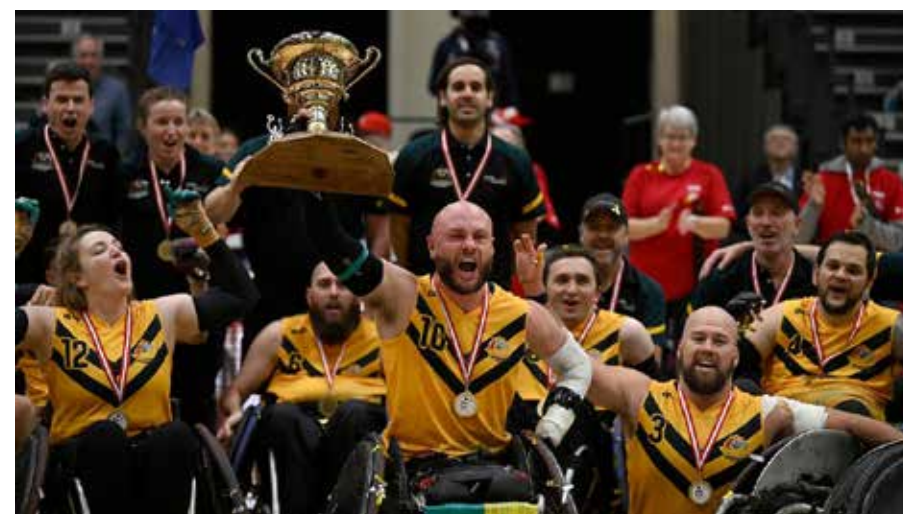
The Australian wheelchair rugby team claimed their second world title after an eight-year wait beating the United States in the final of the 2022 Wheelchair Rugby World Championship in Denmark.