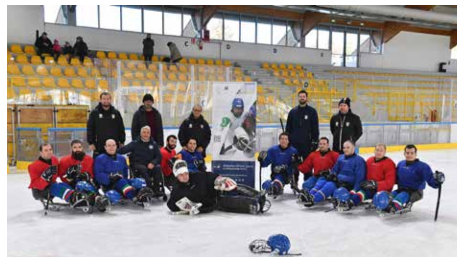
In October 2022 the Milano Cortina 2026 Paralympic Winter Games Organising Committee launched a four-year Adaptive Winter Sport initiative to increase sports participation for people with disabilities through dedicated courses and camps.