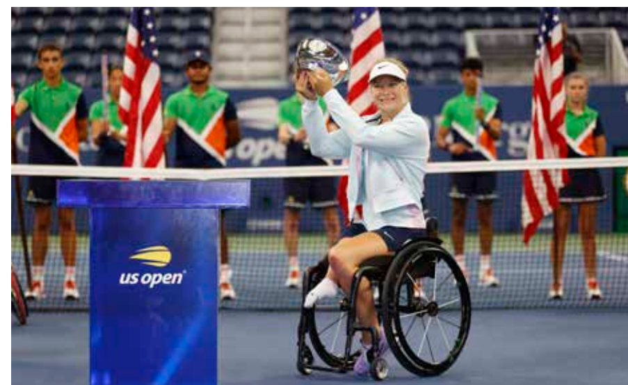
In 2022 Dutch athlete Diede de Groot became the first tennis player ever to win back-to-back calendar Grand Slams.

Unspent monies of EUR 2,910,000 were allocated to reserves, dedicated to providing long-term stability and financial sustainability for the years to come.