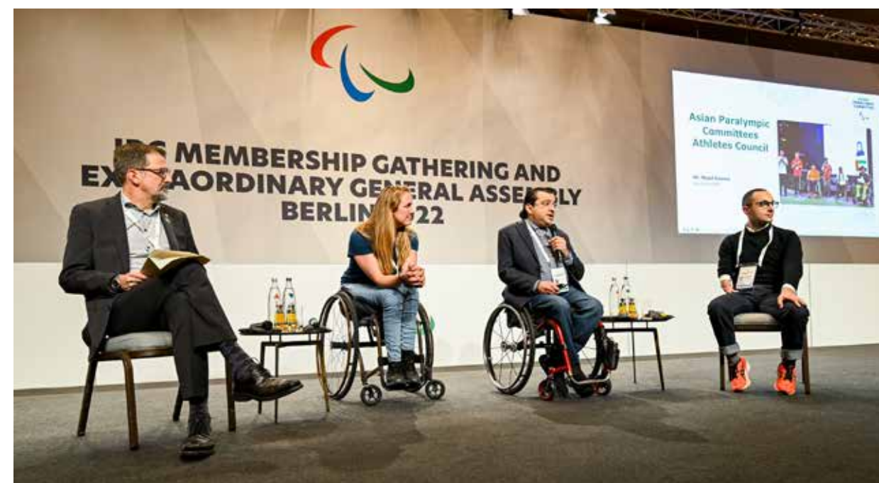
The Membership Gathering was a platform for IPC members to share their own best practice and knowledge.

The event provided an opportunity for the IPC to update members on the progress made on key subjects such as the IPC Governance Review, Classification Code Review, Membership Programmes, and Strategic Plan 2023-2026. All are integral to ensuring the IPC remains a world leading sport's organisation and it was vital we consulted with members on these key areas.